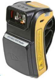
Handheld RFID reader

Bin information is either captured with handheld RFID scanners or automatically with vehicle mounted readers. GPS technology can capture the location of the vehicle at the time of the scan. Data is then transmitted via a mobile network to a central database.