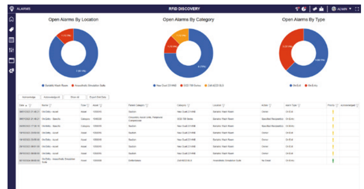
RFiD Discovery software - Alarm dashboard