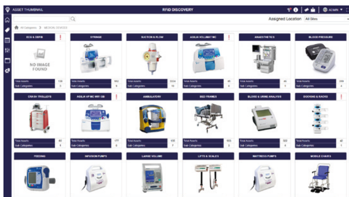
RFID Discovery software - Medical device overview

The solution can use tracking information from many different technologies and is easily integrated with existing asset management systems or other hospital software.