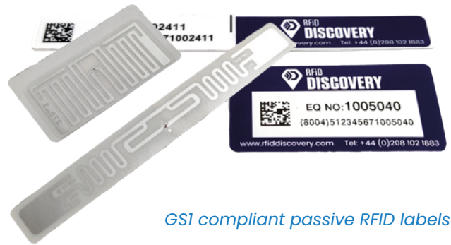
GSI compliant passive RFID labels

At the same time, it provides valuable data for compliance reporting and future planning. Using GSI compliant RFID labels enables hospitals to link the use of specific devices, as well as location, staff ID and medication to a patient to improve patient safety.