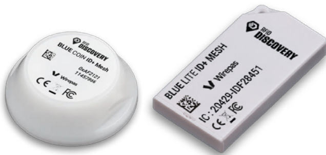
Examples of BLE tags

For accurate real-time location tracking each key medical device is fitted with an active BLE tag, which transmits its unique ID at pre-set intervals. Tags are shock and waterproof, and can withstand standard hospital cleaning processes. Batteries are changed easily, and last between one and five years.