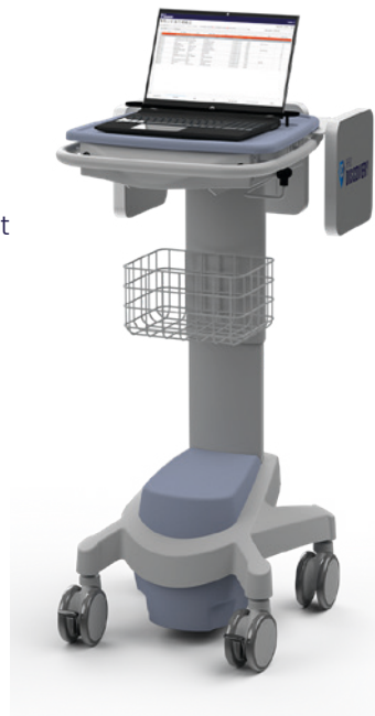
RFID trolley reader

Tags are detected from a distance of up to 11 metres by a specially designed RFID trolley which is pushed around the hospital by a clinical technician. This enables fast and accurate auditing for improved inventory management.