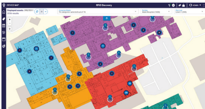
RFiD Discovery software - Map view

Live location data is then sent to a central database and is accessible by hospital staff via an intuitive interface which includes a map view. This means required items can be located quickly by clinical and engineering teams. In addition, the ability to identify individual devices makes incident reporting easy, and can help contain the spread of infection by tracing historic equipment locations.